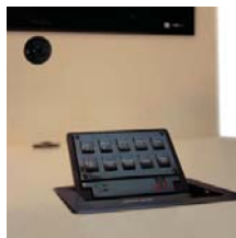
Control Centre that manages your network and media devices