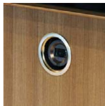
Strategic camera positioning for the "continuous table" perspective