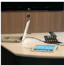
Convenient device dock