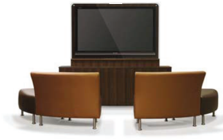
IMT touchpoint cabinet with stills collaborative seating.